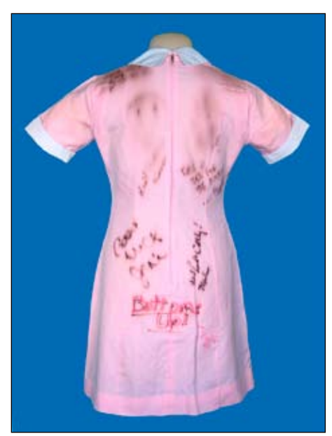
One of the few Queen's Nursing artefacts at the Museum (1977).

he Museum is creating a display to commemorate the 75th anniversary of the Queen's School of Nursing. In the 1930s and 40s a movement of reform was shaking the world of nursing education as