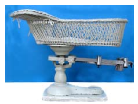
One of the Museum's earliest collected objects: pediatric weight scale (1900).

Following the year-long celebration, the question arose again of what to do with the artefacts particularly the three-dimensional artefacts. Queen's Archives had indicated they were only interested in "paper." Under Dr. Low's leadership, the committee discussed the possibility of a museum and displaying artefacts in the hospital. A curator was contracted to advise on the storage and care of the artefacts and how they could be displayed in the hospital. Advice of many consultants was also obtained during each step of the process. A 50-page report was sent to the KGH Board of Governors in 1990. In the meantime, with changes in medical equipment producing obsolescences and additional nursing artefacts being received, it became apparent that larger storage and display areas were needed. The hospital provided a workroom and the large artefacts located at Queen's Archives were transferred. Cataloguing of artefacts was started in October 1991. The Museum of Health Care at KGH became official at that time. As more and more artefacts were received, the lack of workroom and storage space became a major problem. Museum displays as an educational outreach were set up in the KGH Hall of Honour in the spring of 1994.