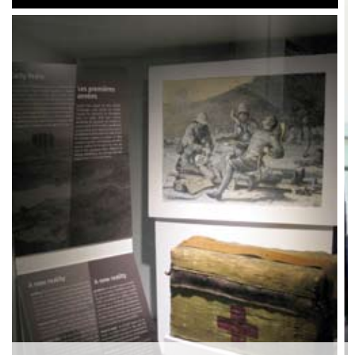
Onsite exhibit "Trench Menders: Health Care during the First World War" opened Feb. 26th and explores the the role of healthcare workers who saved lives at home and abroad.*