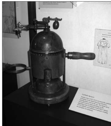
The 1870s carbolic acid spray.

Come and see what's new! Among the gems is the 1870s carbolic acid spray invented by Joseph Lister (1827-1912) in the belief that most infection-causing germs were in the air. The steam spray covered everyone and everything in the operating room or hospital ward with a vapour of carbolic acid or phenol, creating an antiseptic environment.