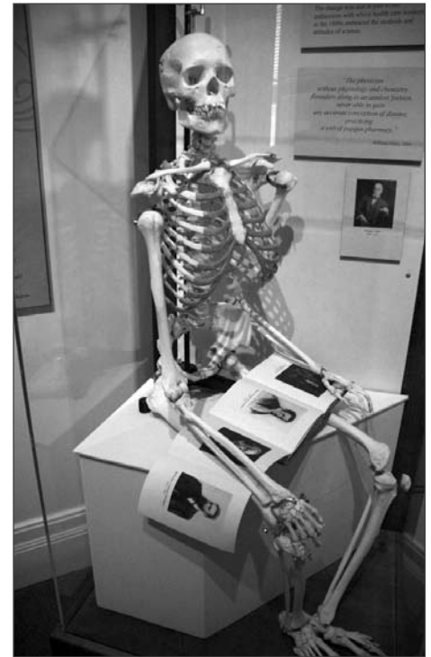
One of the enhanced showcases.

The exhibition features many items from the incredibly rich Toronto Academy of Medicine collection acquired by the Museum in 2002. We drew most of the replacement pieces from the same collection.