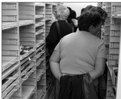
Below: Visitors enjoy a rare sneak peek at the Museum's collection storage rooms.

June 20th was an exciting day for the Museum of Health Care. More than 130 people faced the rain to visit the Museum for Doors Open Kingston. The day was filled with fun and learning for the visitors (and staff).