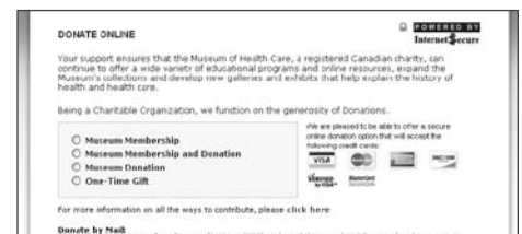
A screen capture of our new "Donate Online" form.

memberships in any form. If you prefer to provide your donation and/or membership by mail, you can still find a .pdf file of our Membership Application Form online on the "Donate Now" webpage.